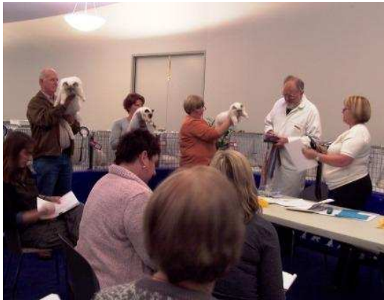
Top 3 kittens, Ring 1