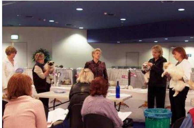
Top 3 desexed cats, Ring 2