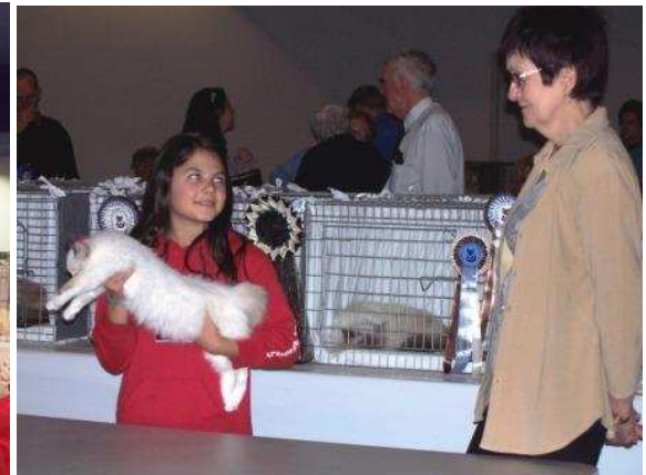
Junior handlers' competition, Ring 3